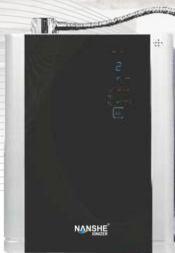
3 PLATE IONIZER