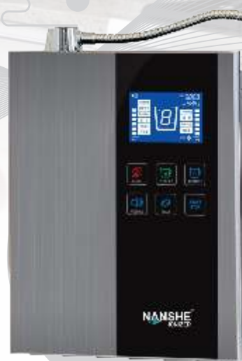
7 PLATE IONIZER