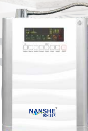
5 PLATE IONIZER